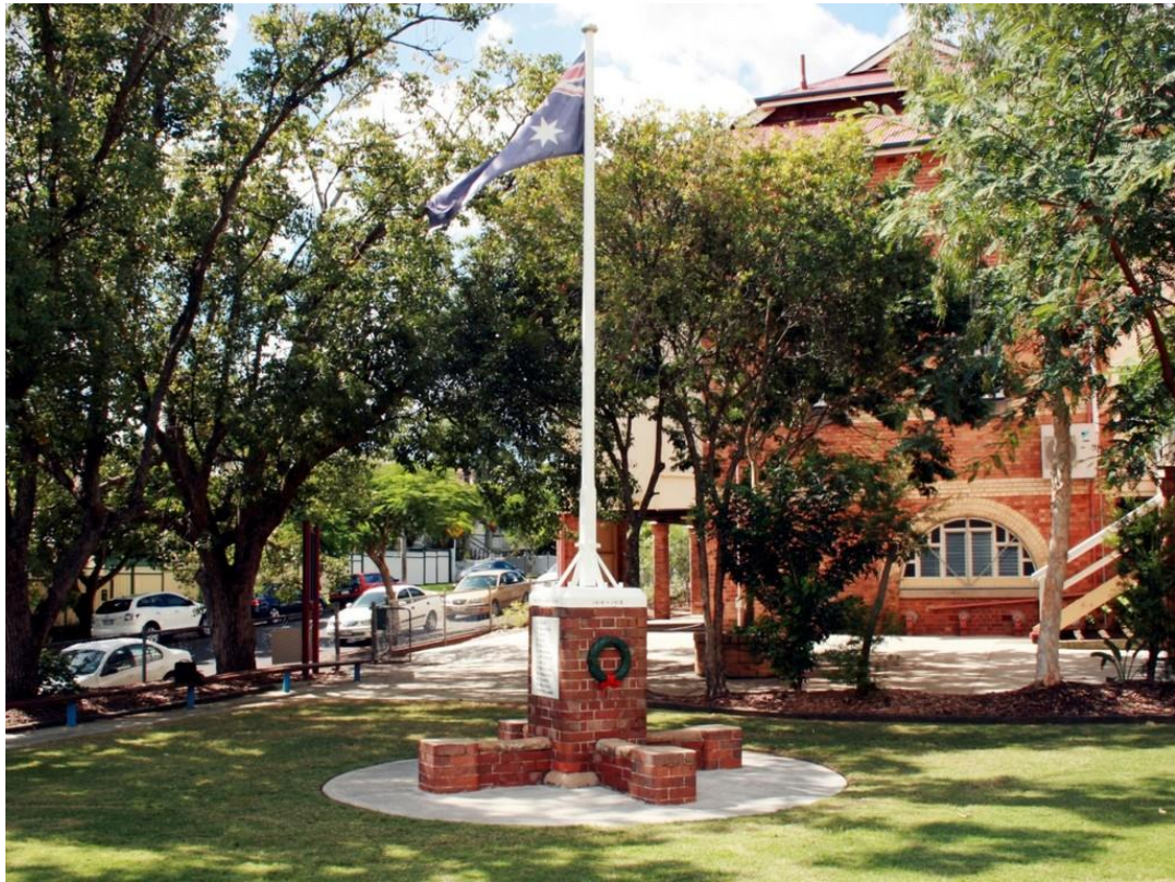
New Farm State School War Memorial