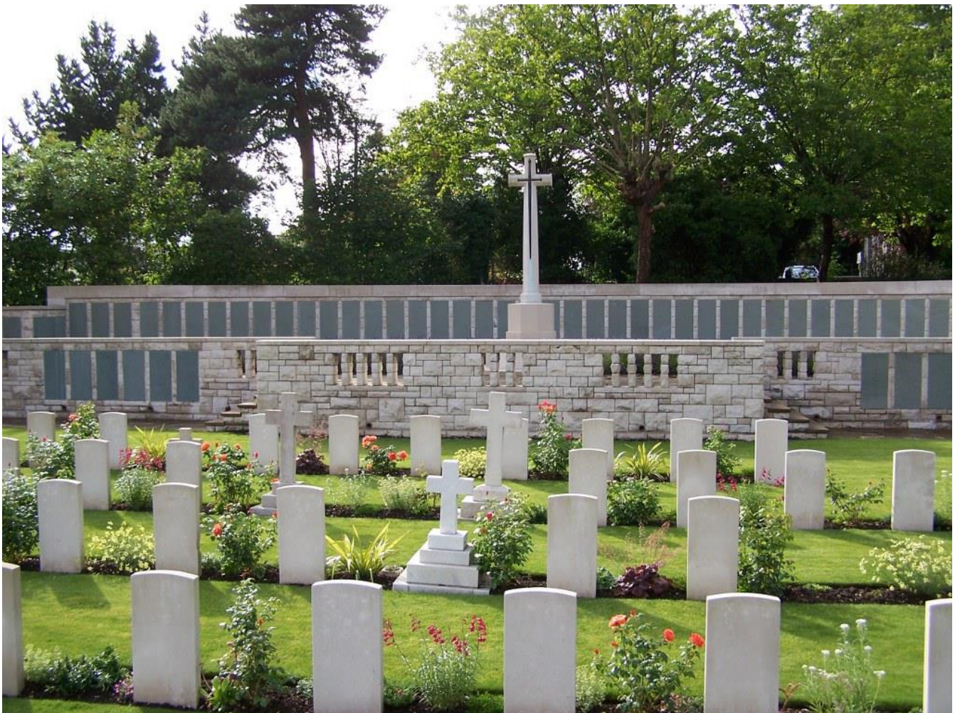
CWGC Graves in Hollybrook Cemetery with Cross of Sacrifice & Hollybrook Memorial