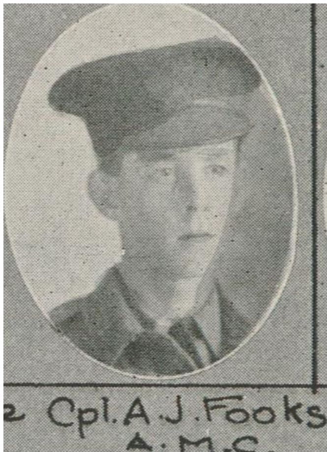
(The Queenslander Pictorial – 2 September, 1916)